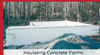
Insulating Concrete Forms